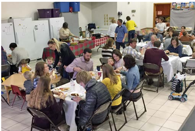
Resurrection OPC enjoying a fellowship dinner