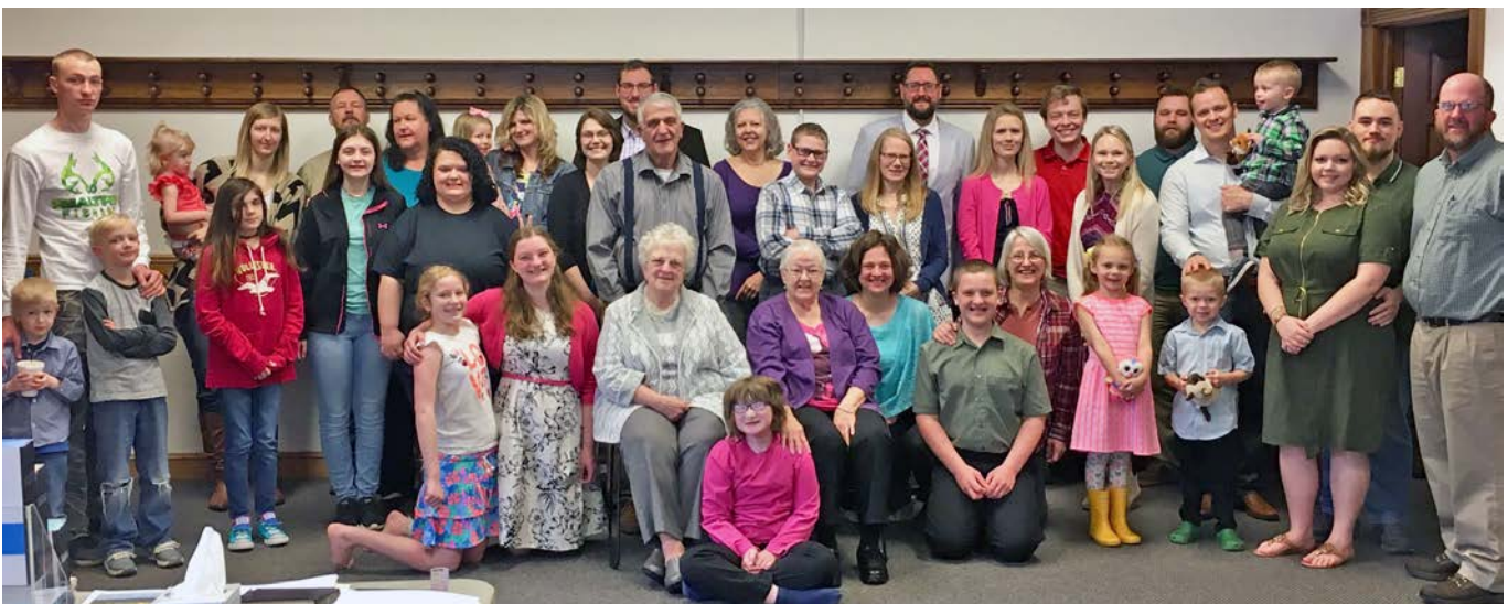
Sunday, April 1, 2018, marked the eighteenth anniversary to the day of the first worship service of the core group that later became Neon Reformed Presbyterian Church. The first service had an attendance of about ten. On April 1, all thirty-seven members were present. The congregation asks for prayer that they would be organized by 2020.