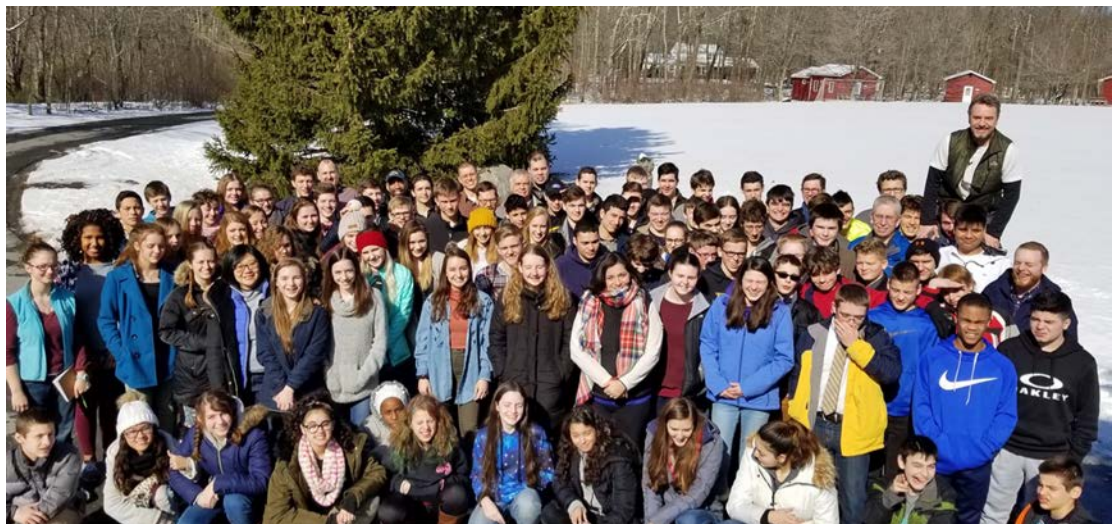
2018 Kamélos Winter Youth Conference