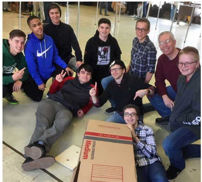
Building a dogsled out of a cardboard box

personal relationship with Jesus Christ in order to grow into the next generation of church leadership,” said Hartlaub.