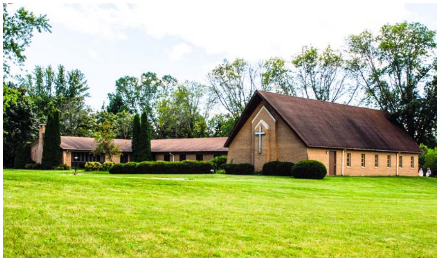
The new church building of Covenant OPC in New Berlin, WI

The sale was completed in February 2018—with an anonymously donated dollar! So God, indeed, did give Covenant a church building—plus a manse and