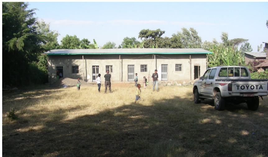
The Theological College in Shashemane, Ethiopia

In Ethiopia, the fields are “white unto harvest,” and it might seem that the laborers are plenty. There are many missionary organizations and missionaries in Ethiopia, but there are few who are Reformed and Presbyterian! The influence of Pentecostals and other groups is at times