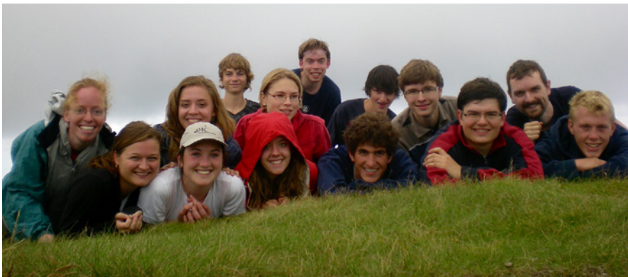
Team Praha on a Slovakian mountain with Czech youths