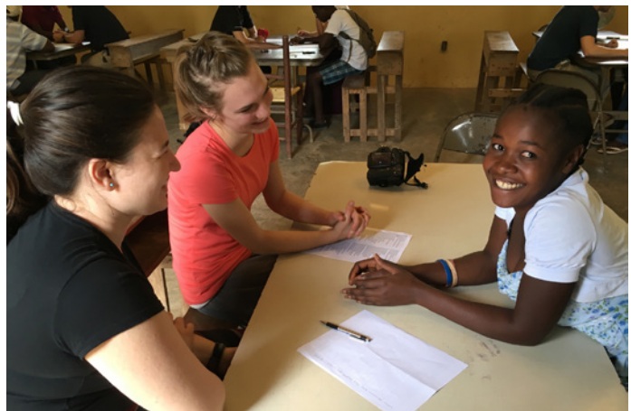
Team members in Haiti practicing English conversation with high school students

The author is the pastor of Christ the King Presbyterian Church in Naples, Fla., and a part-time missionary to Haiti.