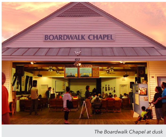
The Boardwalk Chapel at dusk

By the grace of God, the Boardwalk Chapel's seventy-second year of ministry has begun with the same mission of faithful obedience. We still seek to proclaim Jesus to a lost and dying world while equipping