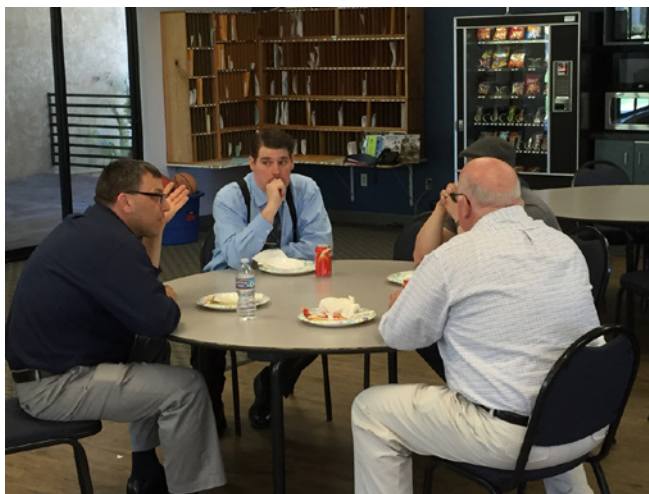
Getting to know participants better over lunch in the Westminster Seminary California lunchroom

The Readiness Seminar also features roundtable discussions of challenging issues that church sessions might address. The students take up the issues among themselves and the observers listen in. We call this exercise "Problem Solving in Reformed Ministry." Of particular interest are the interactions between men who