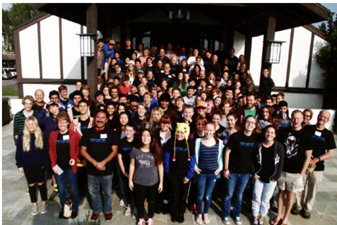
Base Camp 2016 group picture

The author is a member of Resurrection OPC in Westminster, Calif.