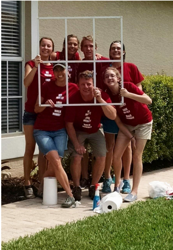
Part of the team from Zion Christian School in Byron Center, Mich., washing windows in Naples, Fla.

sacrificing love. Just this week, we informed 367 families in our neighborhood, through an online bulletin board, that a service team was in town from Michigan, offering to wash exterior windows at no charge. Within a few hours, we had over twenty responses! What a wonderful open door this was to share the love of Christ and show our neighbors that we follow him who “came not to be served but to serve” (Mark 10:45). As the team finished each house, they left a thank-you note that included information about our church and our Biblical Counseling Center. Their humble service and Gospel-seasoned words have introduced us to many neighbors we never knew, and truly brought the love and joy of Christ to many who needed a taste of God’s refreshing grace. Comments posted today on our neighborhood website confirm that the reputation of Christ was clearly honored by the team.