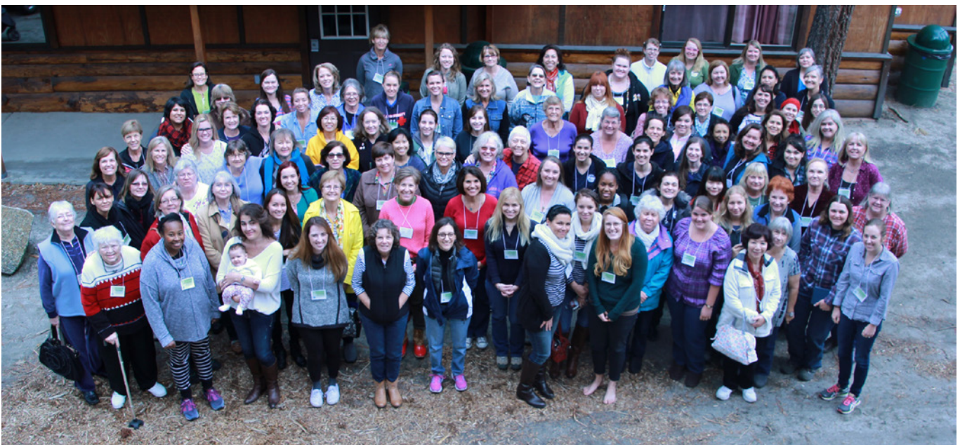
Participants at the Southern California OPC Women's Retreat